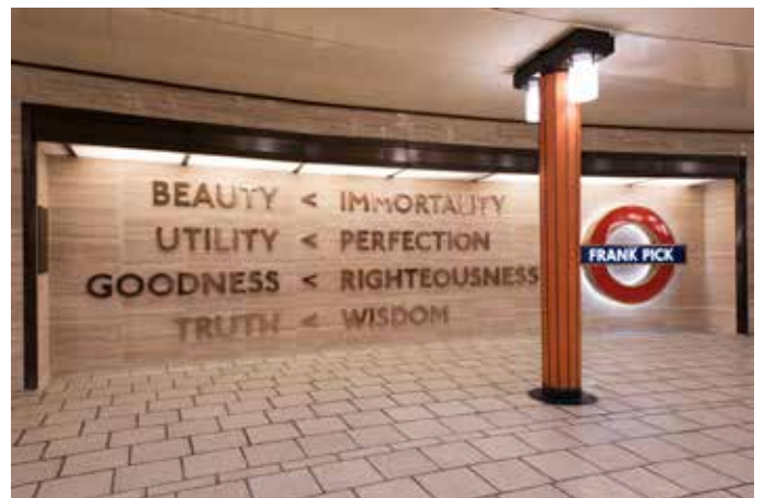
'Beauty < Immortality', Langlands & Bell, Piccadilly Circus station, 2016, Commissioned by London Transport Museum and Art on the Underground.